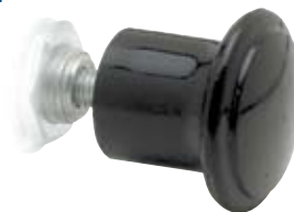
1" round design

Black. 1" (25.0mm) face diameter. 8-32 thread tapped set screw hole.