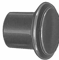
1" round design

Black. 1" (25.0mm) face diameter. 8-32 thread tapped set screw hole.