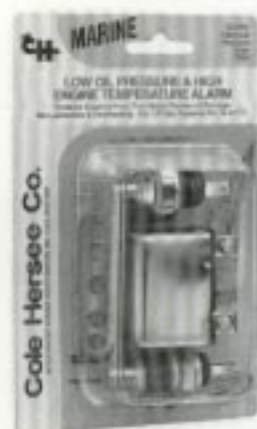
Packaged in attractive, fast selling Bubble Pack

Warning buzzer sounds when engine oil pressure is too low and/or engine coolant temperature is too high.