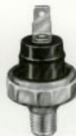
Oil Pressure Switch