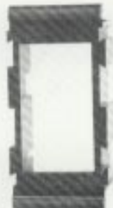
No. 82159-2 Center Section