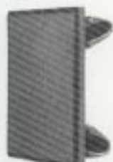
No. 98628 Bracket Hole Plug

For use with Cole Hersee snap-in mounting rocker switches with narrow bezels and part numbers in the following series: