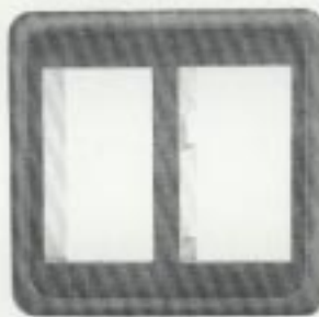
Install two switches using two end sections.