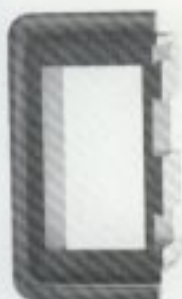
No. 82159-1 End Section