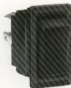
Weatherproof housings. Non-glare matte finish.