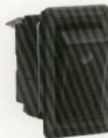
Single pilot lights.