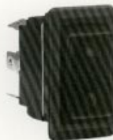
Dual pilot lights.